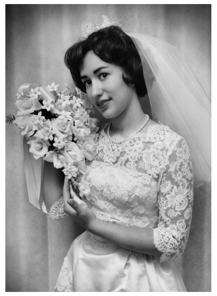
A bridal portrait in New York, circa 1950.